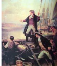
Never stop serving!