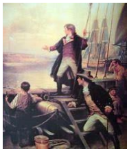
Never stop serving!