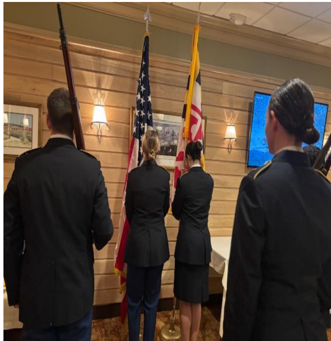
Loyola ROTC Color Guard Cadets post the colors to begin the meeting.