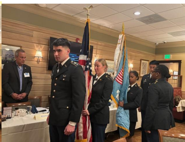
The Loyola ROTC Color Guard retires the colors at the conclusion of the meeting.