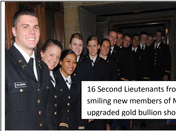
16 Second Lieutenants from Towson University, smiling new members of MOAA with their upgraded gold bullion shoulder boards.